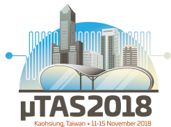
Exhibit & Sponsorship Application

The undersigned APPLICANT, agreeing to be legally bound hereby, applies for exhibit booth space and/or contribution in the 22 nd International Conference on Miniaturized Systems for Chemical and Life Sciences described above and is subject to the terms, conditions, and requirements stated herein. The μTAS Conference, upon its written acceptance of this Application, is to assign exhibit booth space or contribution to the Applicant under all of the terms, conditions, and requirements as aforesaid. Applicant applies for one of the available booth locations or contributions at the fee indicated below. Booths and contributions will be assigned on a first-come first-served basis. The Conference Committee has the right to amend booth locations and times if necessary.